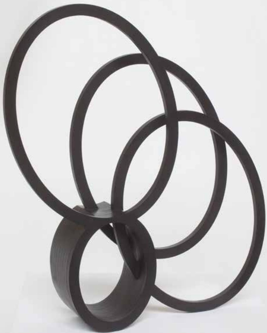
OVERLEAF: Little Southern Shade IV (60 cm) 2018, Bronze, 60 x 55 x 10.7 cm