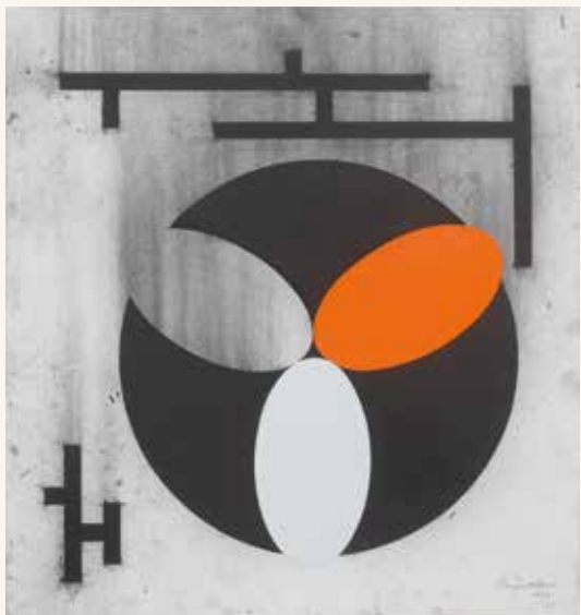
Drawing 1934 2022, Charcoal and acrylic, 60 x 56 cm

Two new fully illustrated books have been published this year: Nigel Hall Drawings , published by Royal Academy 2024 and Nigel Hall Sculpture & Drawings , published by Lund Humphries 2024.