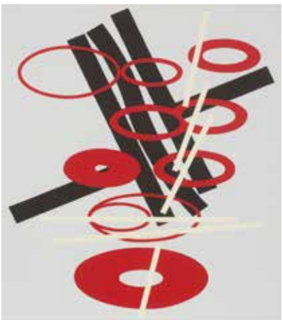
Summer Storm 2021 Paper size 34.7 x 28.5 cm Screenprint edition of 70