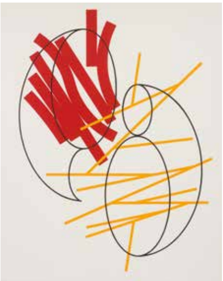
CLOCKWISE: Gemini 2022 Paper size 30.5 x 39.2 cm Screenprint edition of 70