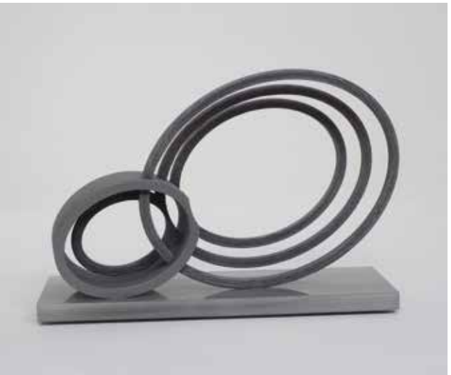
Gravity/Levity 2015, Copper, 29 x 20.7 x 4 cm The Light in Darkness 2023, Printed nylon on perspex base, 12.7 x 19.5 x 6.9 cm, Edition of 3