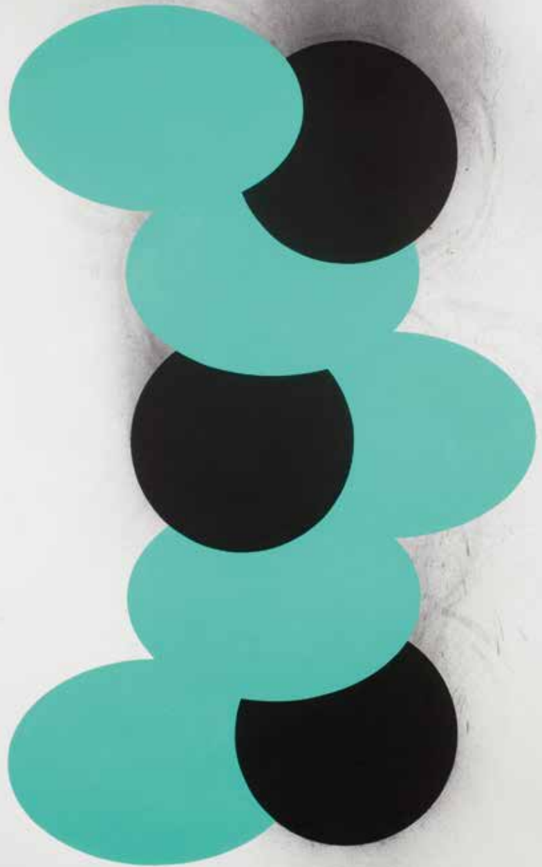
OVERLEAF: Drawing 1700 2015, Charcoal & acrylic, 153 x 122 cm