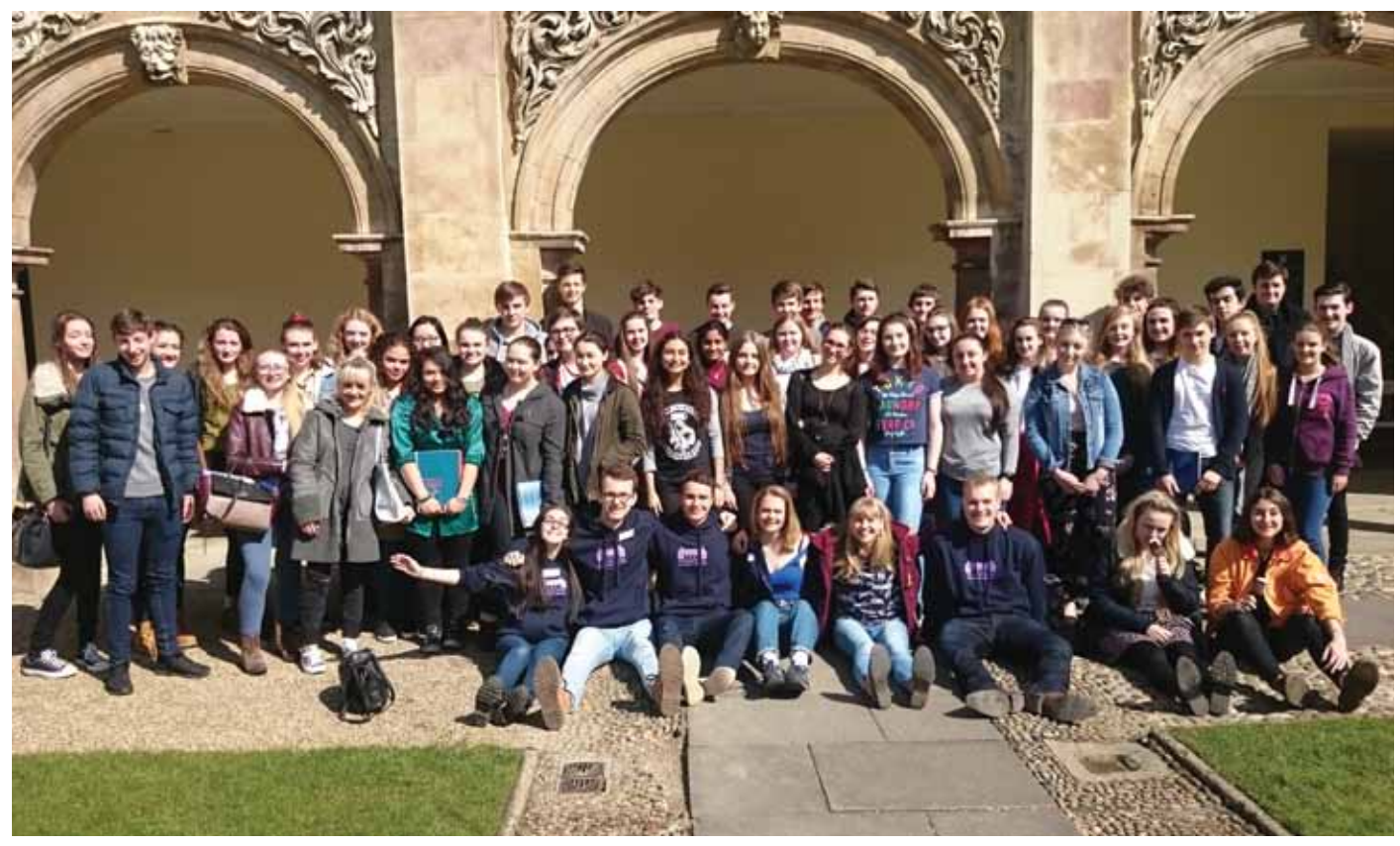
Access residential at Magdalene March 2016.

The College is committed to encouraging young people with the academic potential and enthusiasm to succeed at Cambridge, to apply, regardless of their school or background.