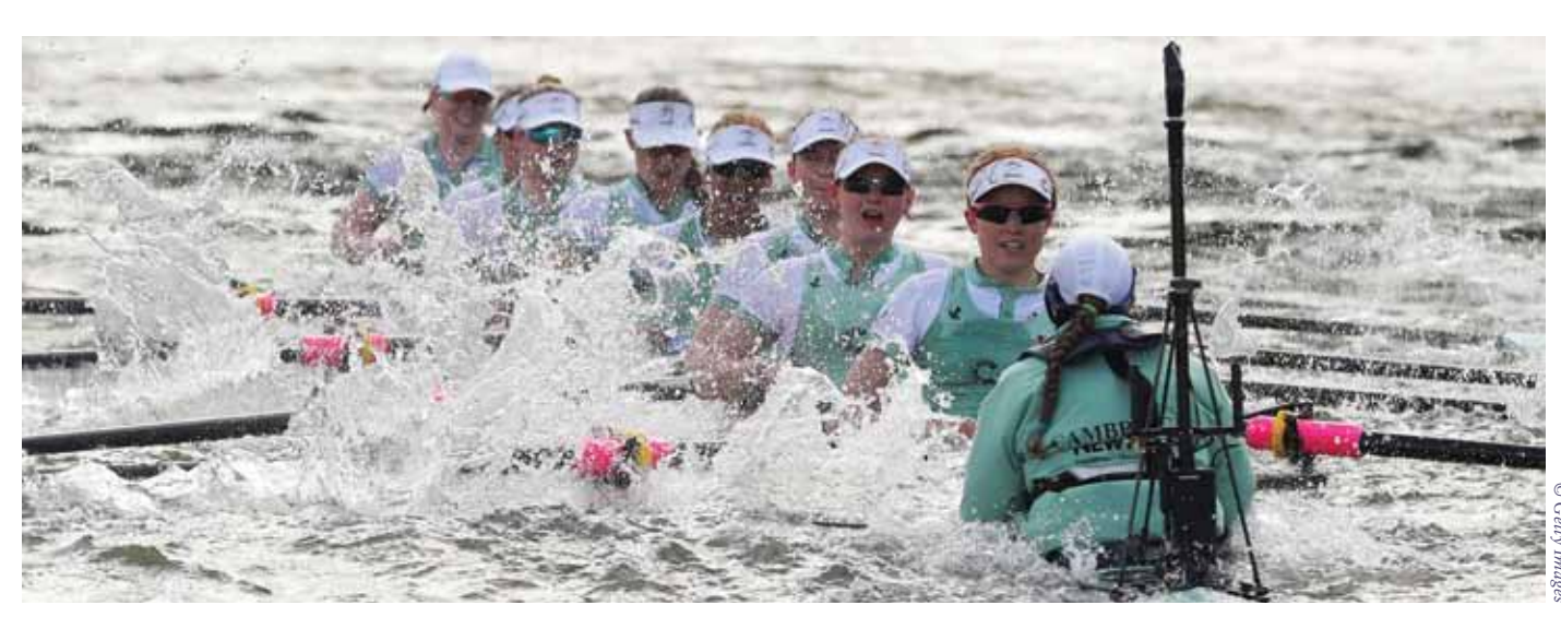
The CUWBC crew battling the elements!

The Boat Race this year was fantastic for the University as a whole – wins for the men's Blue Boat, after 3 years of Oxford supremacy, and for Blondie, CUWBC's reserve boat. We can all enjoy those moments together – after all, we are Cambridge!