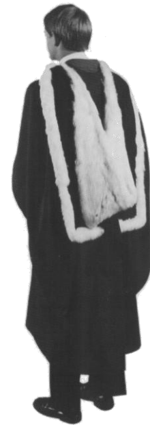
Bachelor of Arts (B.A.)